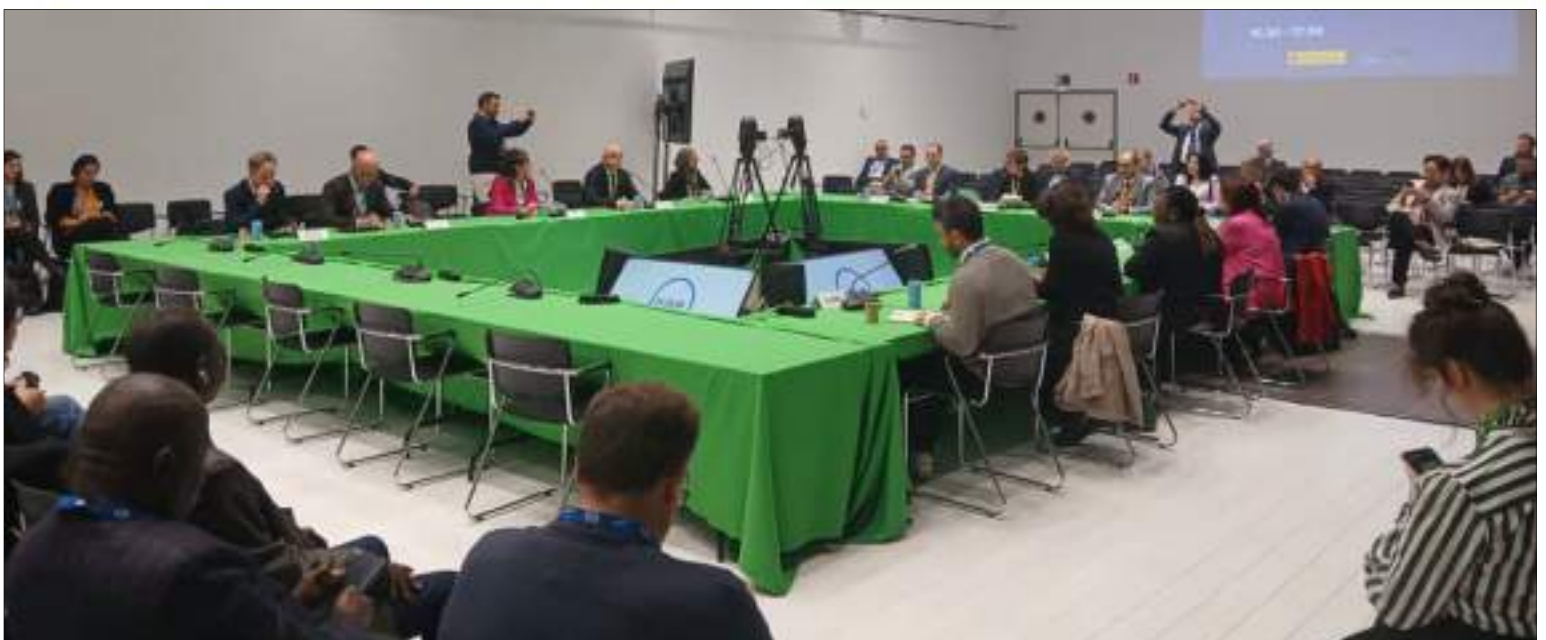
A section of participants at the Summit