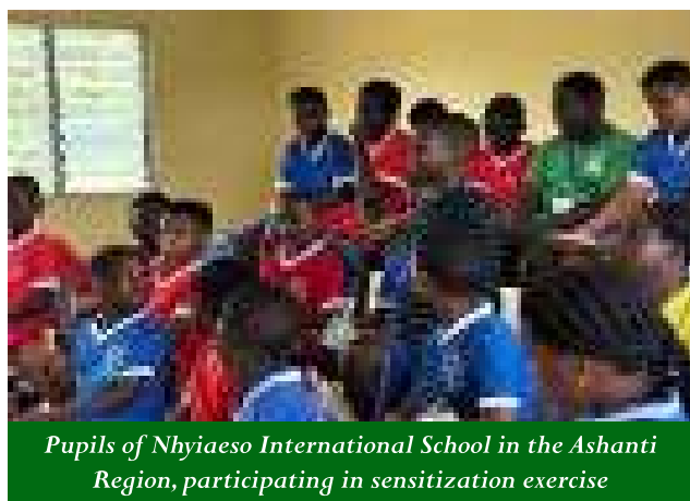
Pupils of Nhyiaeso International School in the Ashanti Region, participating in sensitization exercise

the powers of the commission to enforce the law as well as the support of other institutions in pushing the successful implementation of the law.