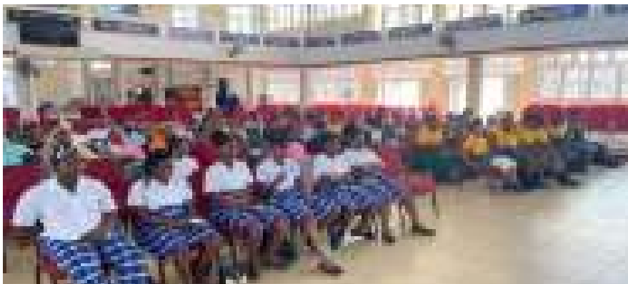
A Section of the audience during the sensitization exercise

The interactive session that followed provided an opportunity for participants to seek clarifications, and feedback indicated that the information shared was well-received and effectively understood by the audience.