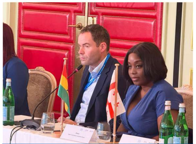
Closed Door Session

The Commission also highlighted its extensive stakeholder engagement efforts particularly in the development of the Legislative Instrument (LI)