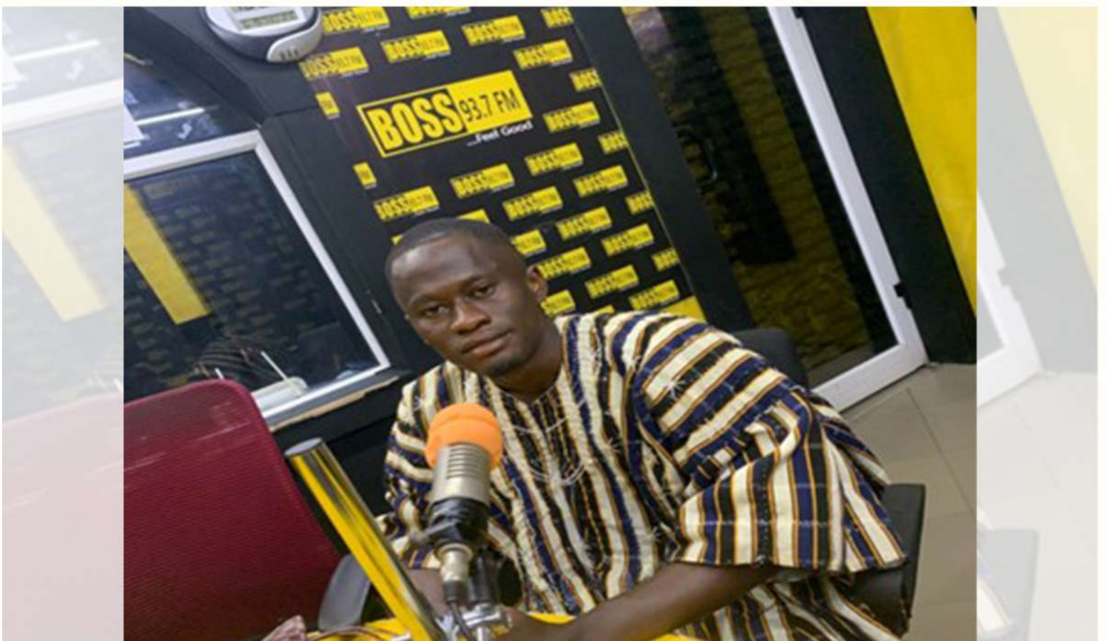
RTI Commission staff sensitizing listeners on the RTI Act on Boss 93.7FM, Kumasi

These engagements served as valuable platforms for dialogue, learning, and collaboration—further solidifying the Commission’s position as a champion of transparency. As we move forward, the Commission remains dedicated to expanding its outreach, building strategic partnerships, and empowering both institutions and individuals to exercise their right to information confidently and responsibly. The journey toward an informed and transparent Ghana continues—and with every voice, every question, and every engagement we move one step closer.