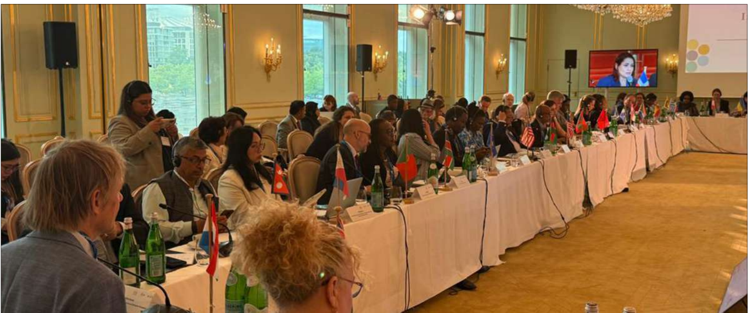
A section of participants at the Conference